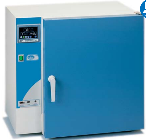
Model Digitheat, Part No. 2001251, 2001252 and 2001254.