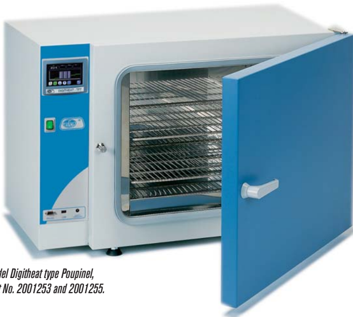
Model Digitheat type Poupinel, Part No. 2001253 and 2001255.