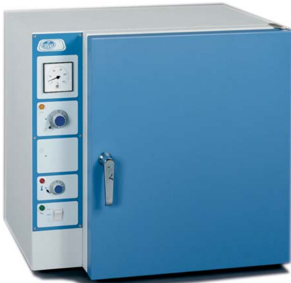
Models Conterm, Part No. 2000208, 2000209 and 2000210.

FEATURES, CONTROL PANEL, SAFETY, STANDARD AND ACCESSORIES (see pages 139 and 140).