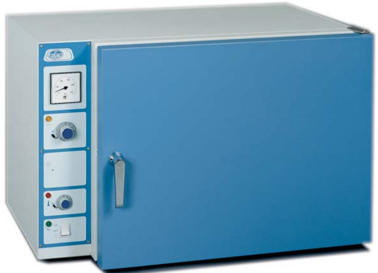
Model Conterm type Poupinel, Part No. 2000200 and 2000201.